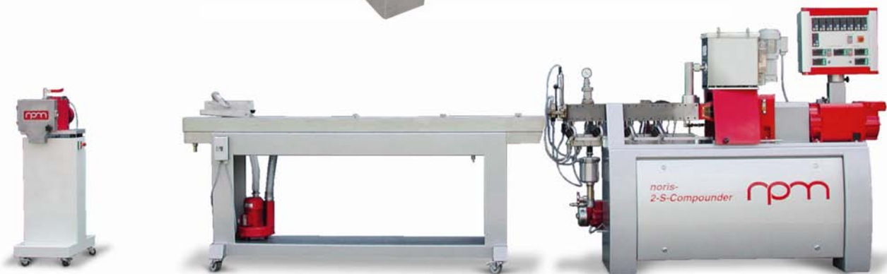
LAB – Granulieranlage mit ZSC 25 und Stranggranulator LSG 40 ▲ LAB – pelletizing plant with ZSC 25 and strand pelletizer LSG 40

Der neue noris-2- Schnecken-Compounder setzt Maßstäbe in seiner Klasse ! Er verbindet perfekte Technik mit außergewöhnlichem Design.