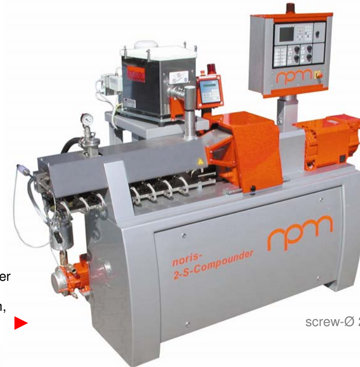
LAB –2S Compounder Type ZSC 25; Schnecken-Ø 25 mm, mit Dosierung ▲